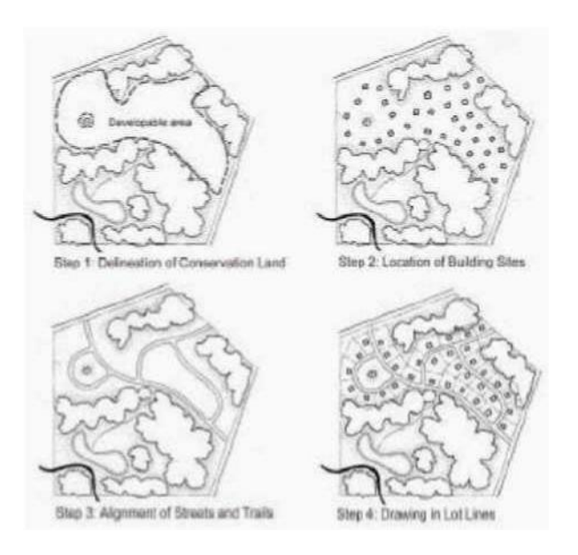
Figure 6-2: Four Step Design Process for Conservation Subdivisions

Potential building areas shall be tentatively located using the map delineating Conservation Lands, supplemented by existing conditions data required for Conceptual Plan approval. Buildings should generally be located no closer than one-hundred (100) feet from Primary Conservation Areas and fifty (50) feet from Secondary Conservation Areas, taking into consideration the potential negative impacts of residential development on such areas as well as the potential positive benefits of such locations to provide attractive views and visual settings for residences. Locating building areas on ridges, hilltops, along peripheral public streets or in other visually prominent areas should be minimized.