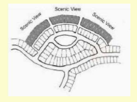
Figure 6-1: Lot Frontage on Conservation Lands